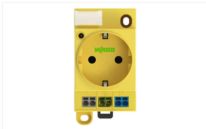
Color: ■ signal yellow