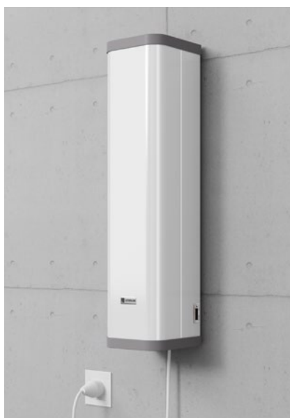
Version with cord (3 m)