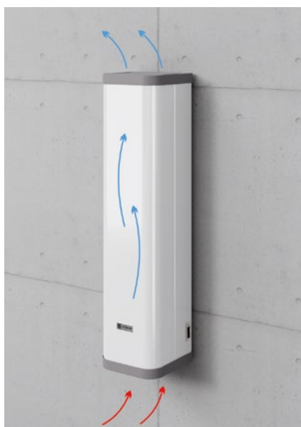
Airflow disinfection function

The design of the luminaire interior ensures perfect air flow and the highest level of disinfection efficiency. The UV-C Sterilon Air luminaire is equipped with protection against opening. Removing the top cover requires a hex key.